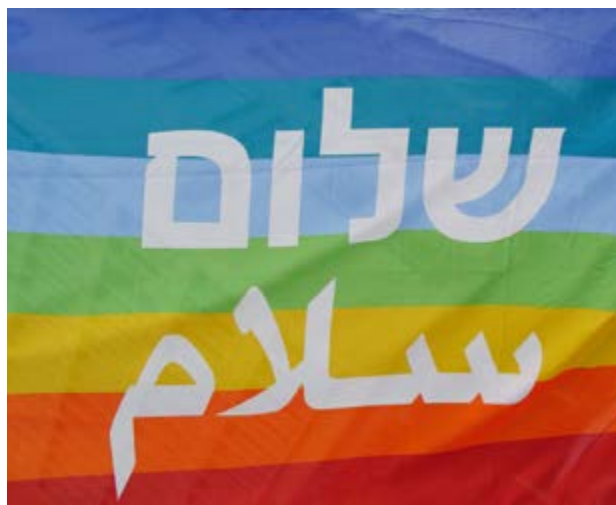
Words of Peace: Shalom in Hebrew and Salaam in Aramaic

In small groups of 3 or 4 ask students to write down on post-its or small pieces of paper 5 or 6 words or phrases which stand out to them from exploring the exhibition. It might be something they saw, read or the way that something made them feel.